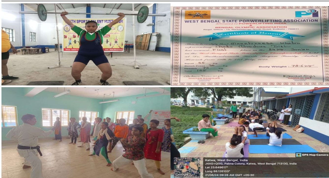
Glimpses of some activities of Girl students at College Campus