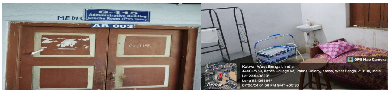
Child care Centre or crèche