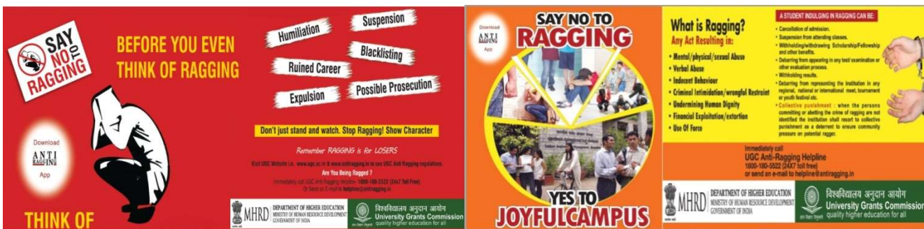
Anti-Ragging Posters at the Campus