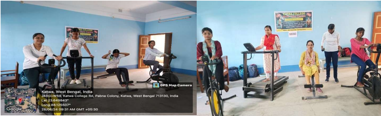
Girl students at gymnasium of College