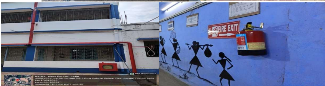
Fire Extinguisher Systems in the College campus